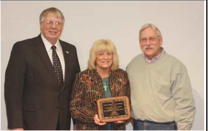
Central Iowa Fair, Marshalltown – NC District