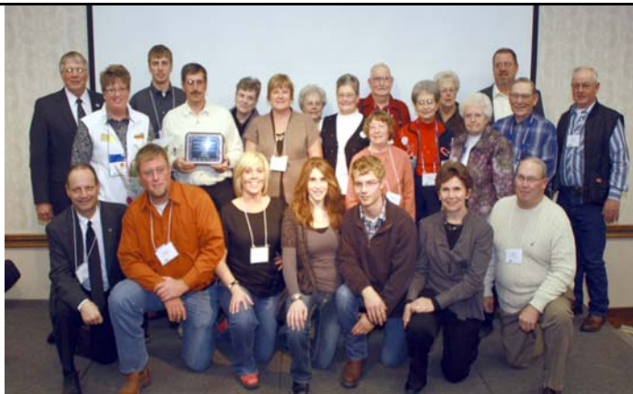
Warren County Fair, Indianola – SC District