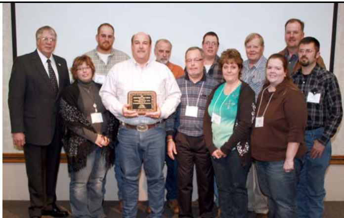
Cherokee County Fair, Cherokee – NW District