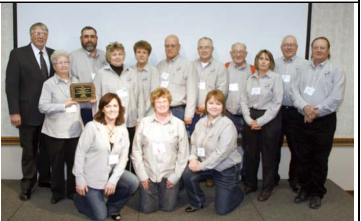
Davis County Fair, Bloomfield – SE District