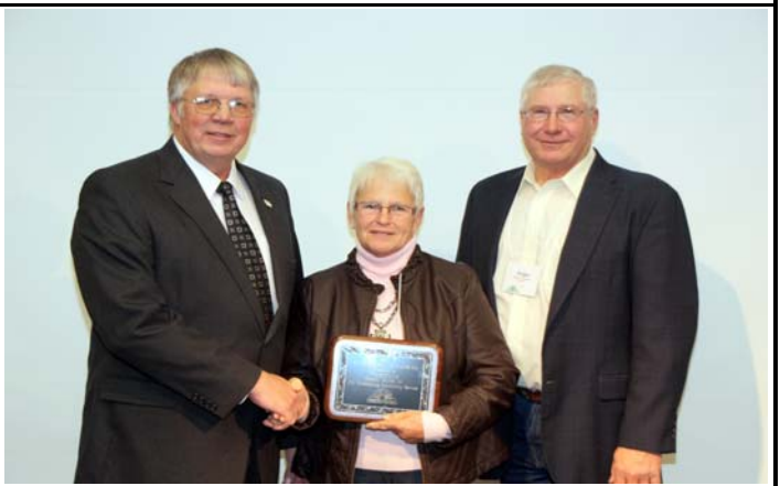
Westfair, Council Bluffs – SW District