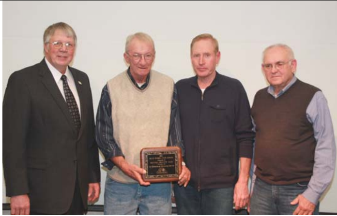
Benton County Fair, Vinton – NE District