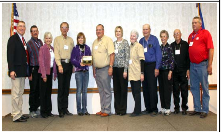
Van Buren County Fair, Keosauqua – SE District