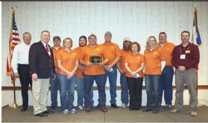
Ida County Fair, Ida Grove – NW District