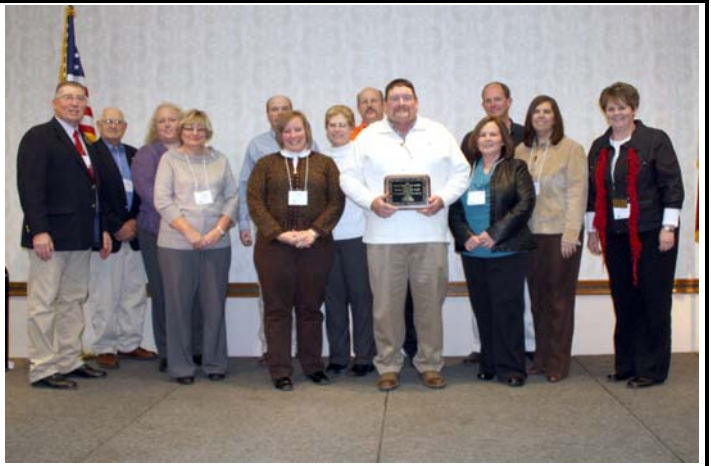
Story County Fair, Nevada – NC District