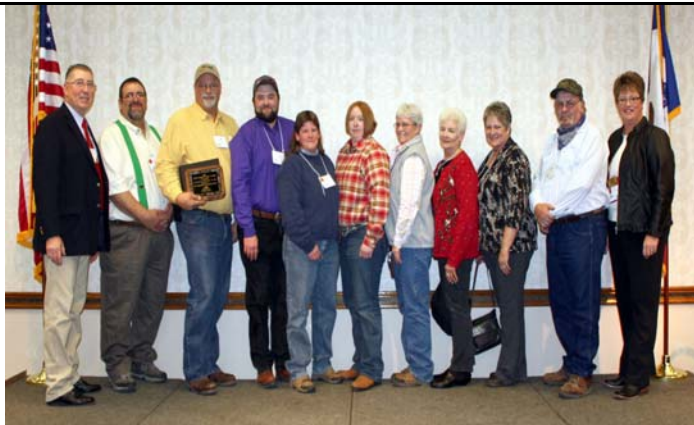
Clarke County Fair, Osceola – SC District