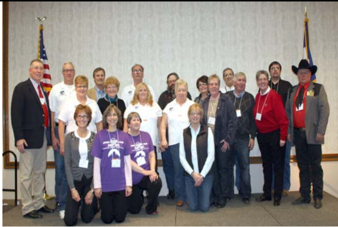
Great Jones County Fair, Monticello – NE District