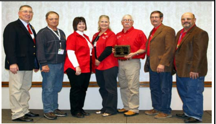
Adams County Fair, Corning – SW District