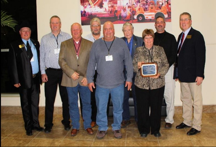
Jackson County Fair, Maquoketa – NE District