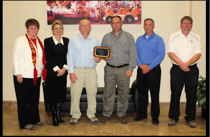
Kossuth County Fair, Algona – NC District