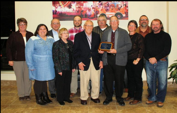
Polk County 4-H/FFA Fair, Des Moines – SC District