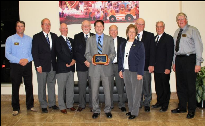
Clay County Fair, Spencer – NW District