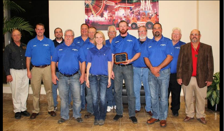
Shelby County Fair, Harlan – SW District