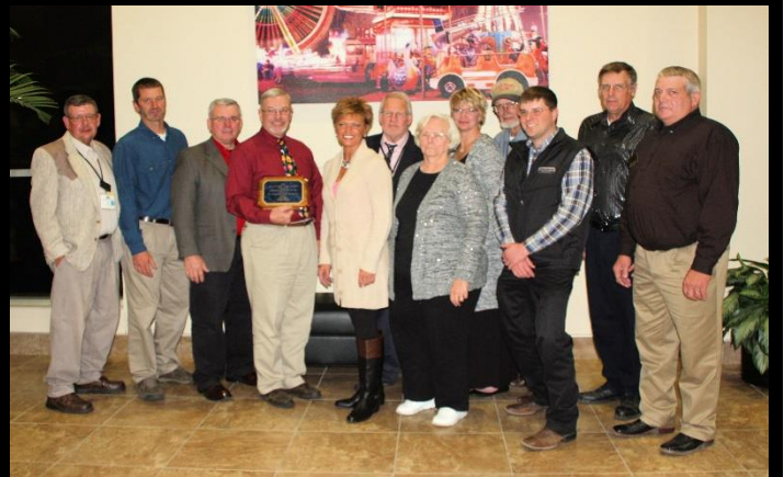
Cedar County Fair, Tipton – SE District