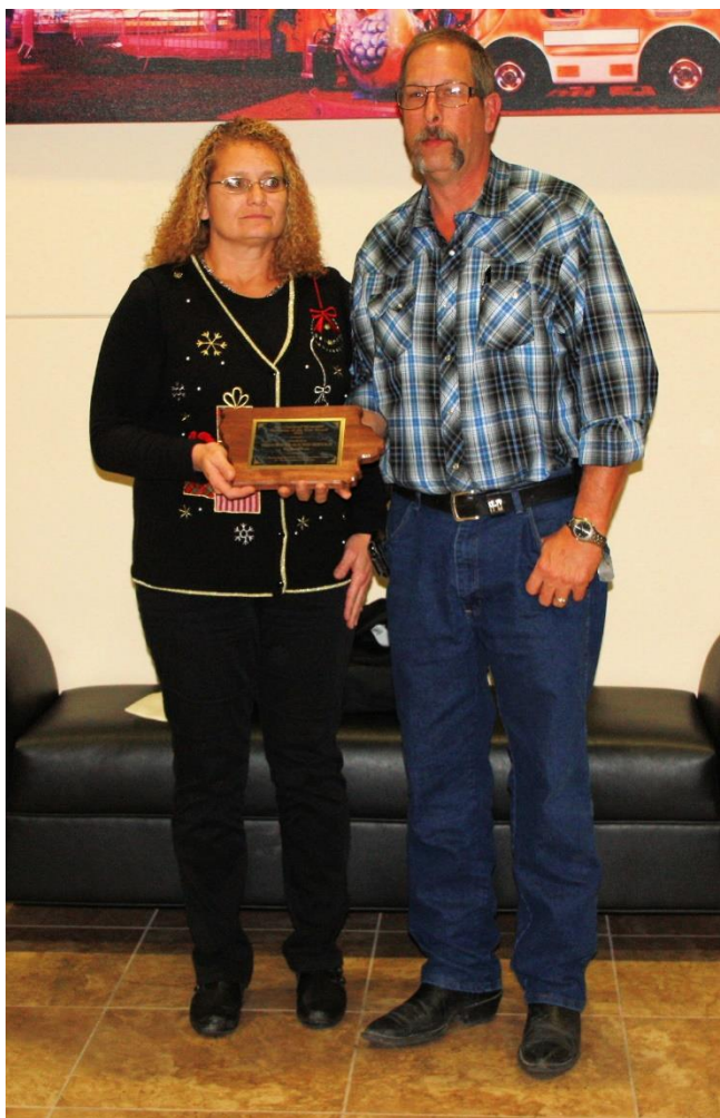
Hendricks Sound Service Fairfield Iowa was honored with the 'Leo Overland Showman of the Year' award.