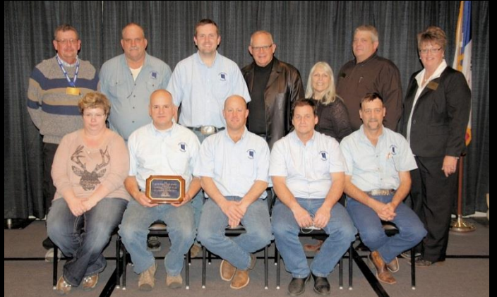
Johnson County Fair, Iowa City – SE District