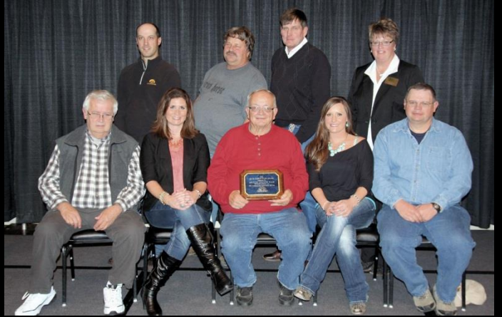
Grundy County Fair, Grundy Center – NC District