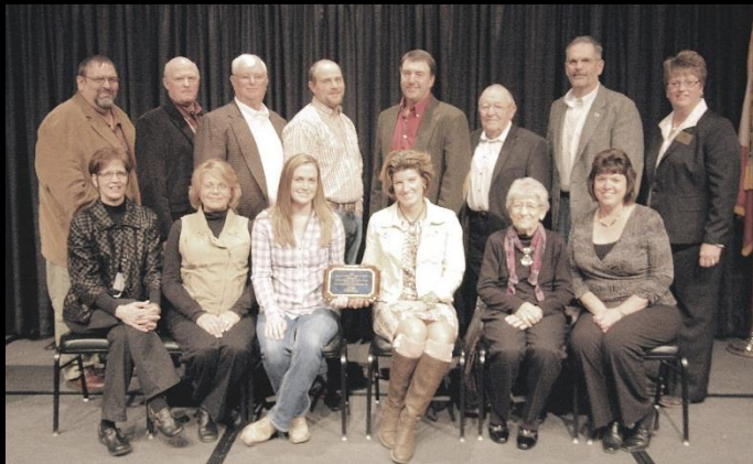
Appanoose County Fair, Centerville – SC District