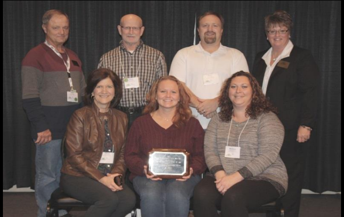
Monona County Fair, Onawa – SW District