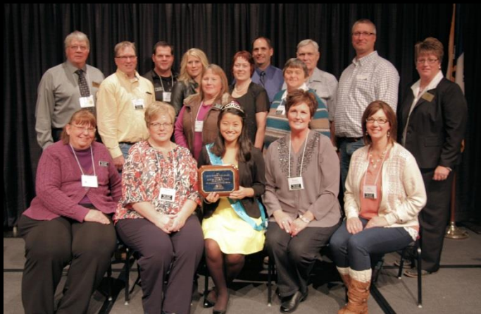
Sioux County Youth Fair, Sioux Center – NW District