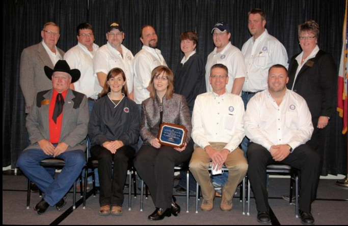
Delaware County Fair, Manchester – NE District