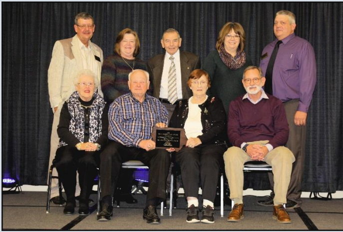
Mississippi Valley Fair, Davenport – SE District