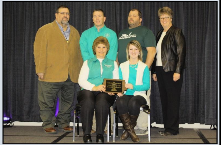
Lucas County Fair, Chariton – SC District