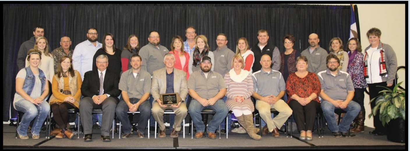
Franklin County Fair, Hampton – NC District