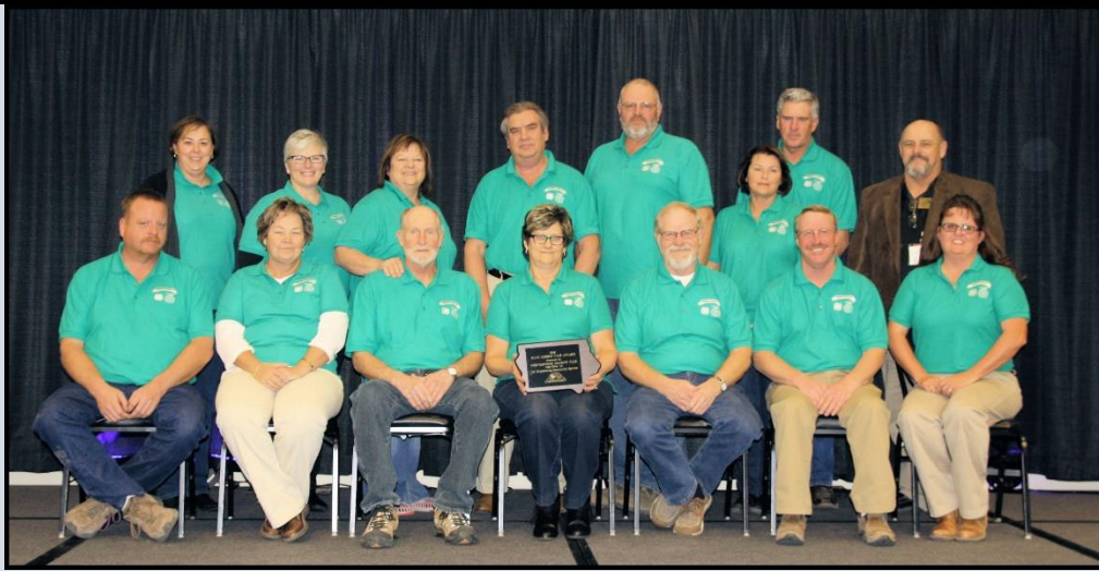
Montgomery County Fair, Red Oak – SW District