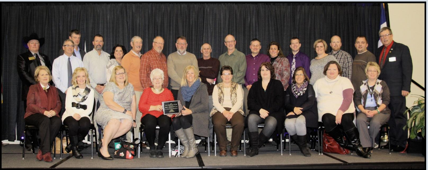
Mighty Howard County Fair, Cresco – NE District