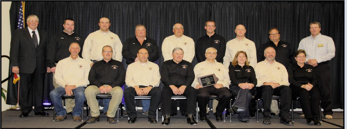
Plymouth County Fair, Le Mars – NW District