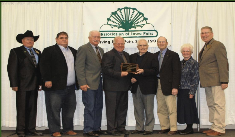
National Cattle Congress, Waterloo – NE District