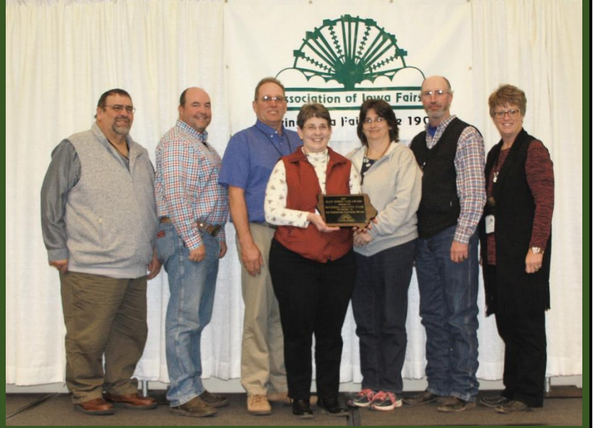
Madison County Fair, Winterset – SC District