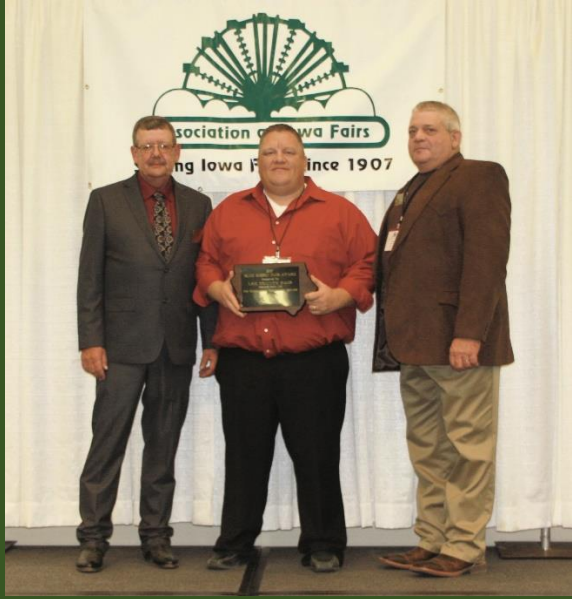
Lee County Fair, Donnellson – SE District