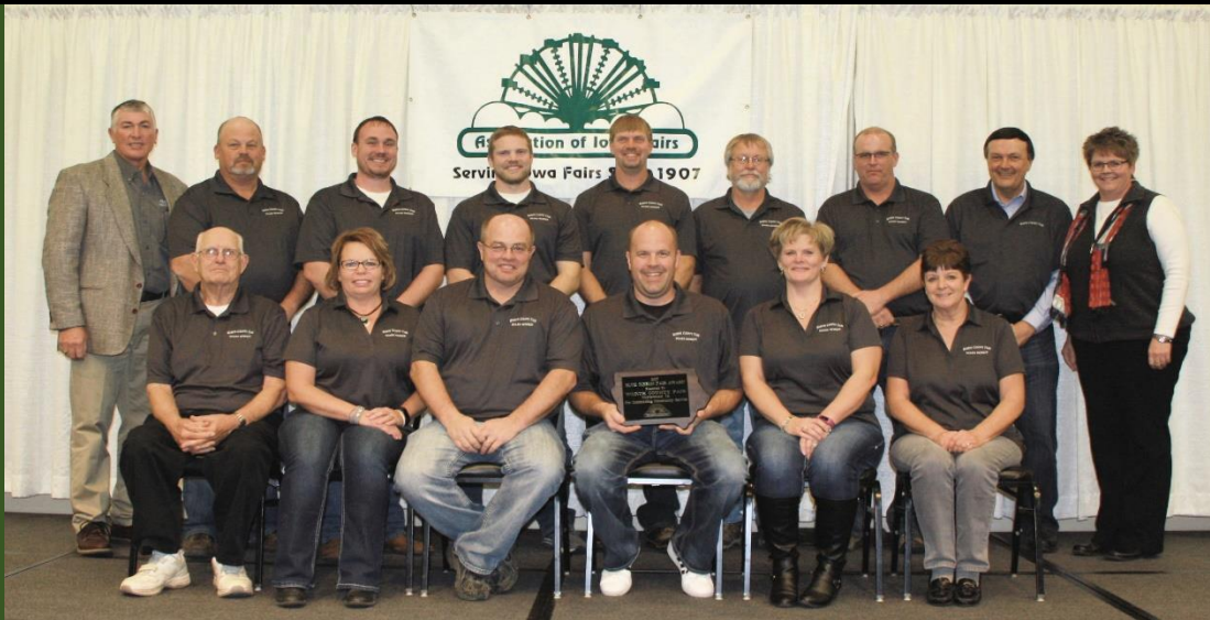
Worth County Fair, Northwood – NC District