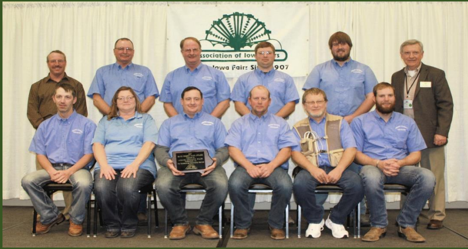
Adair County Fair, Greenfield – SW District