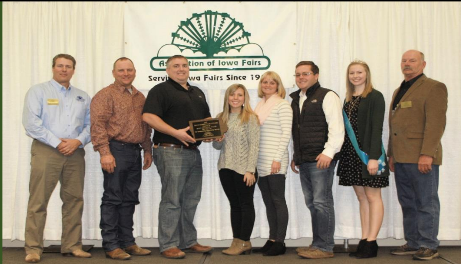
Sac County Fair, Sac City – NW District