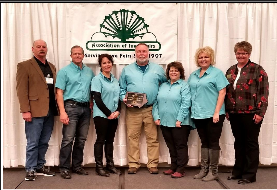
2018 Blue Ribbon Award ----- North West District ----- EMMET COUNTY FAIR Estherville