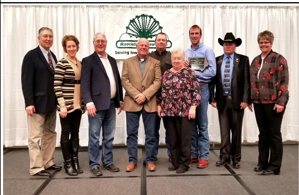
2018 Blue Ribbon Award ----- North East District ----- WYOMING FAIR Wyoming