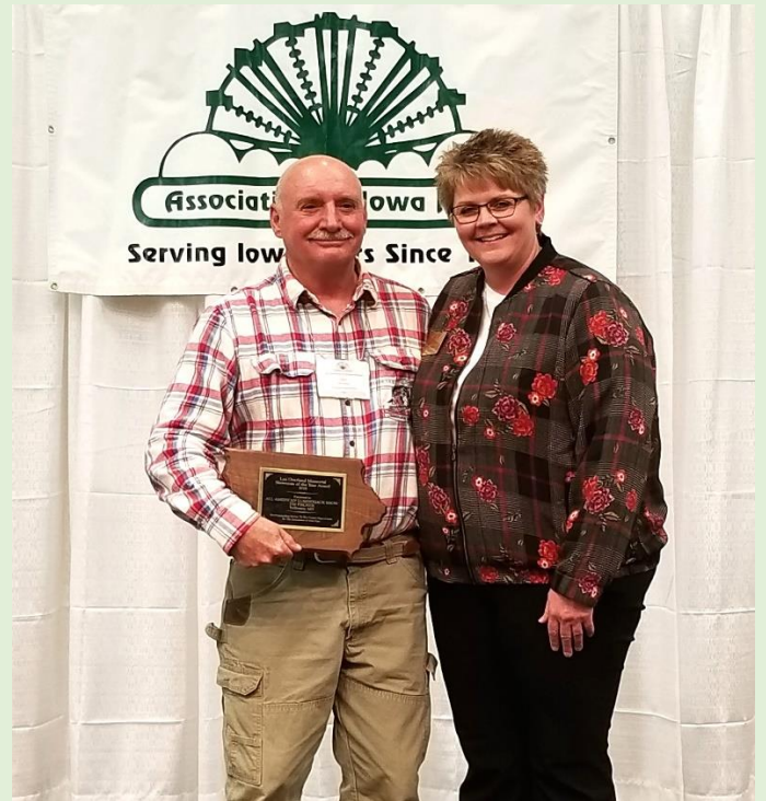
Leo Overland Memorial Showman of the Year