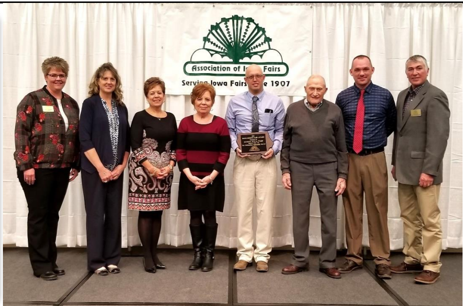
2018 Blue Ribbon Award ----- North Central District ----- NORTH IOWA FAIR Mason City