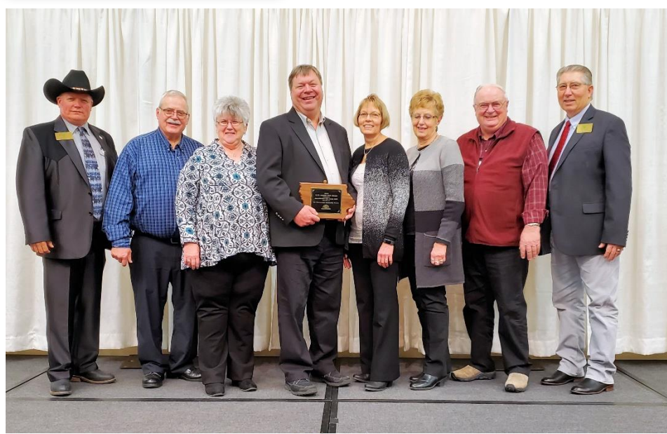
2019 Blue Ribbon Award ----- North East District ----- BIG FOUR FAIR Postville