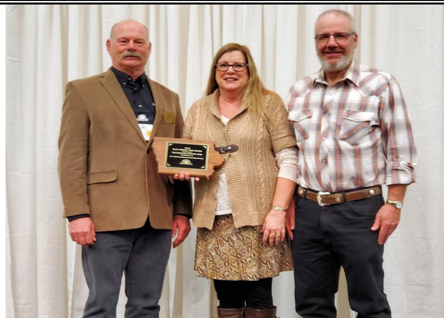
2019 Blue Ribbon Award ----- North West District ----- POCAHONTAS COUNTY FAIR Pocahontas