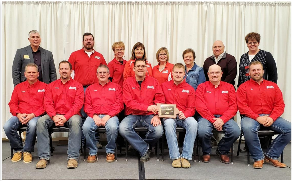
2019 Blue Ribbon Award ----- North Central District ----- HANCOCK COUNTY FAIR Britt