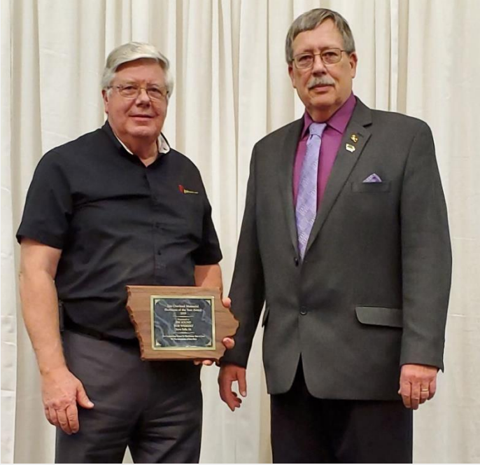
Leo Overland Memorial Showman of the Year