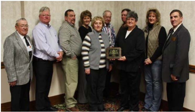
Monroe County Fair, Albia – SC District