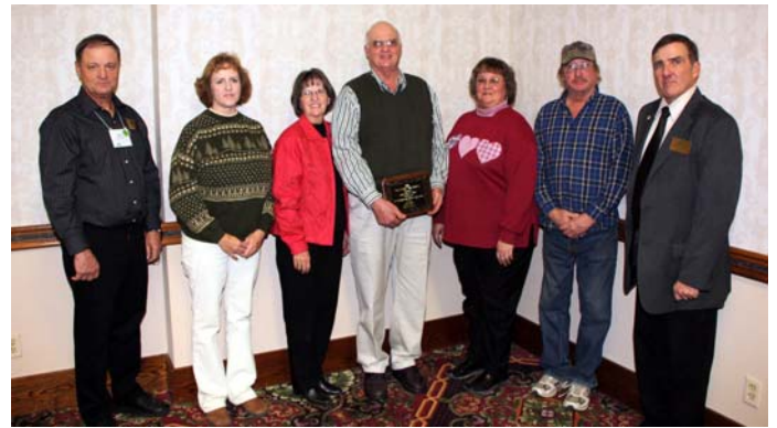
Page County Fair, Clarinda – SW District