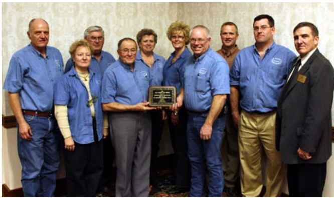
Dickinson County 4H & FFA Fair, Spirit Lake – NW District