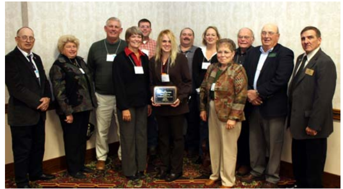
Clinton County Fair, De Witt – SE District