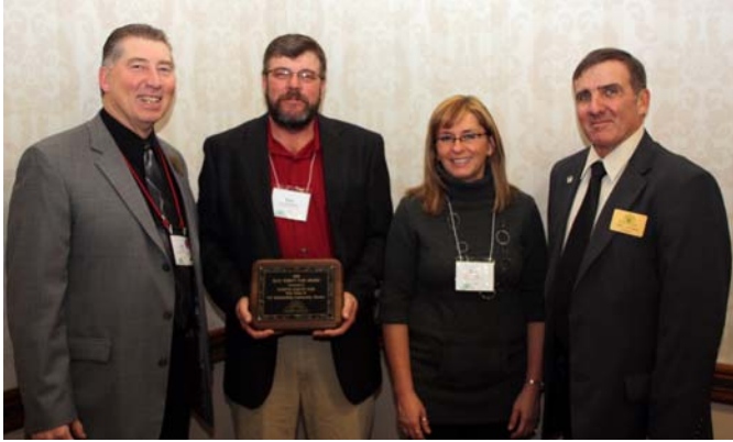
Fayette County Fair, West Union – NE District