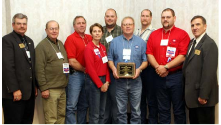
Boone County Fair, Boone – NC District